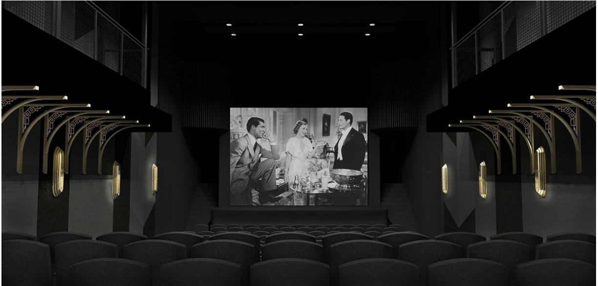
A perspective look from the back of the ground level in Paradise Theatre. Rendering credit: Solid Design Creative

Osteria Rialto , the main floor 83-seat restaurant marries Art Deco accents with rustic wood features through custom wall treatments and hand-painted floor patterning, while the all-season restaurant patio, which holds 53 of the seats, carries a bright, fresh tone throughout that will add a renewed energy to the street level.